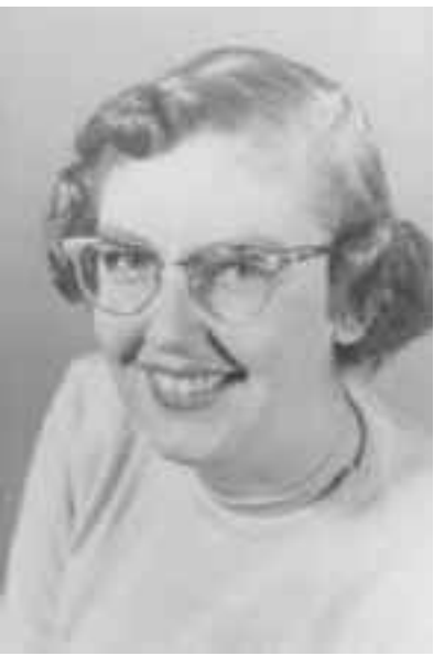
1 June 1954 (TUES) 2100 (JAP) 0800 (EDT)