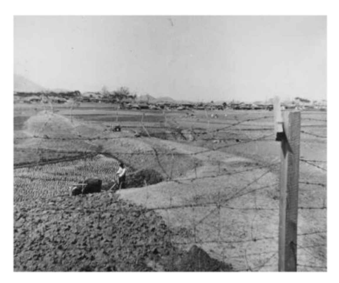
4 April 1954 (Sun) 1730 (Jap) 0330 (EST)

Excerpts: Well honey, today I went to church for the first time in three weeks and felt real good about it. The Chaplain preached a good sermon on the topic "What ye sow, so shall ye reap". At the beginning he mentioned the signs that Spring is around the corner. You know, the farmers tilling their paddies and by the aroma in the air. He meant of course the schidt on the paddies.