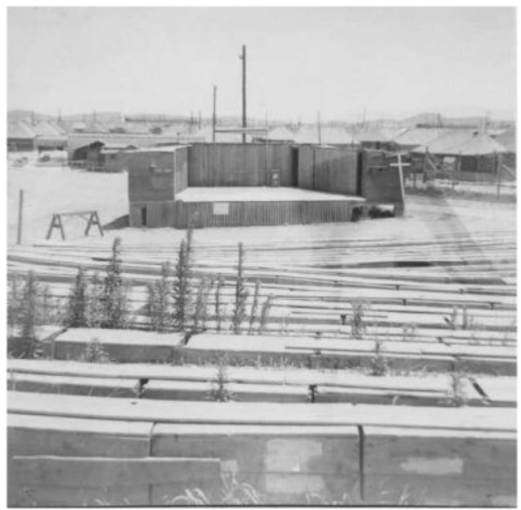
"The Rice Bowl"

5 April 1954 (Mon.) 1930 (Jap) 0530 (EST)